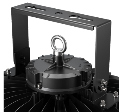
Fix ceiling mounting