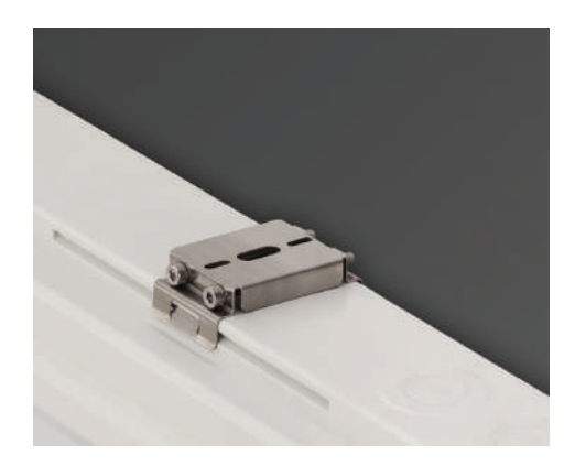
Mounting on the wall or ceiling